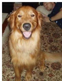
SISCO SEEMS TO BE SMILING, HE IS SO HAPPY IN HIS NEW HOME.