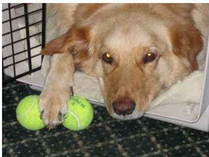
AUSTIN RELAXES BUT IS READY TO PLAY.