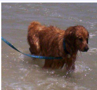
STOLI (WHOSE RESCUE NAME WAS JEREMY) ENJOYS THE BEACH AT HIS NEW HOME AND MAKES FRIENDS WHEREVER HE GOES.