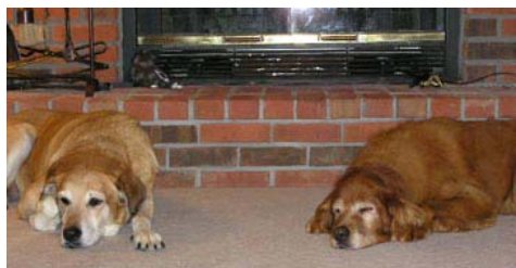
SENIOR RORI (WHOSE RESCUE NAME WAS AURORA)

ENJOYS A SNOOZE BY THE FIREPLACE WITH HER NEW DOGGIE SISTER CASSIE.