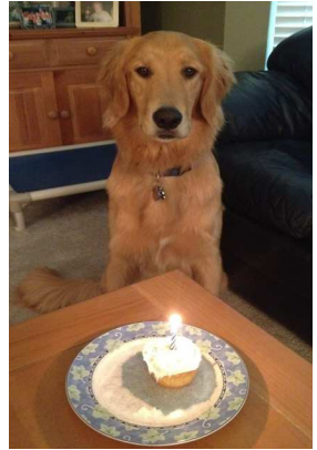
Rudy, formerly Kory. Happy 1st birthday Rudy! It's your big day. (He's such a sweet boy!)