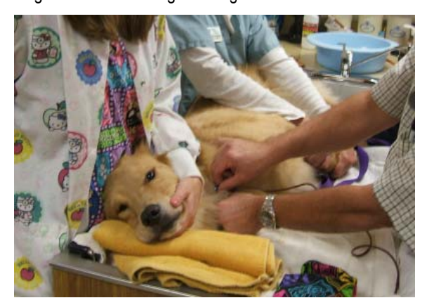
"universal" type, since they can give to either a positive or negative dog.

worm test, and two tick titers- Ehrlichia Canis and Lyme disease. Donating blood takes only approximately 10-15 minutes, and each unit of blood can theoretically help two different dogs because after collection it is separated into packed red cells and plasma. Dogs do have blood types like people do, however we are most concerned with the 1.1 antigen on the canine red blood cell, as it is the one most commonly associated with transfusion reactions. Therefore, they can either be DEA 1.1 positive or negative. DEA 1.1 negative dogs are said to have the