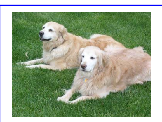
ADOPTED SENIOR GOLDENS CALI AND JAZZ RELAX IN THE YARD. WHAT PRETTY GIRLS!