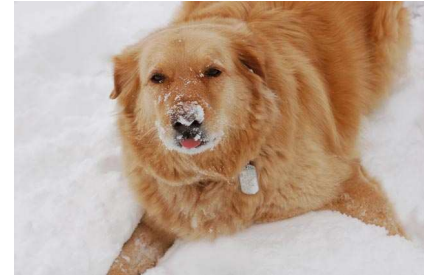
AUSTIN IN THE 10 INCHES OF SNOW WE RECEIVED .