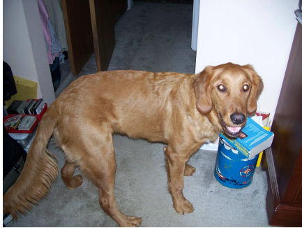
BAILEY FORMERLY SIMON WAS VERY SICK AS A PUPPY, HE HAS GROWN INTO A HANDSOME GOLDEN AND IS LOVED BY ALL