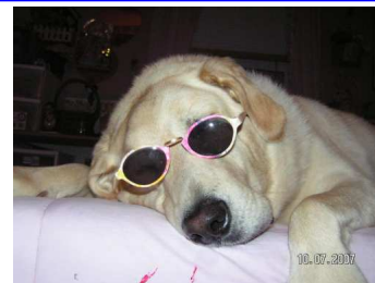
A COOL PICTURE OF BANSHEE (WHAT A PATIENT DOG HE IS!).